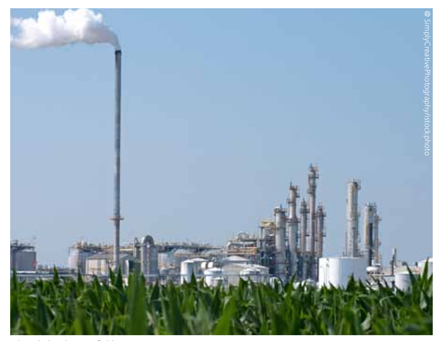
Ethanol plant by corn field.

" Conventional biofuels such as ethanol, biodiesel, biogas are the only commercially available low emission option to replace fossil fuels at present. For many years these will be needed – bedding the path for advanced biofuels."